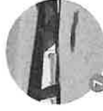
10 Rio Hondo Confluence