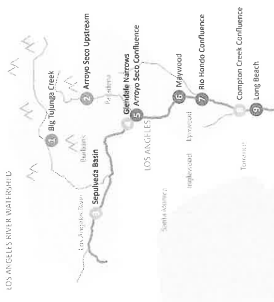
Map by A Map of the Los Angeles River Watershed, www.mapoflosangelesriverwatershed.com

We monitored a range of locations throughout the LA River watershed including tributaries, mainstem-tributary confluence points, and concrete-lined channels. We separated the locations into three categories based on the degree of physical alteration. We chose our targeted locations based on where there was community interest in monitoring, where we could safely access the stream, and/or where there was a connection to a proposed restoration or revitalization project. We also wanted to study a diverse range of freshwater habitats. There are very few sites along the mainstem of the river that could fit into the "natural" category except for some sections of the Sepulveda Basin.