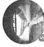
8 Compton Creek Confluence

Sections of the river and tributaries with a concrete bottom and concrete levees.