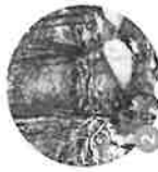
2 Arroyo Seco Upstream