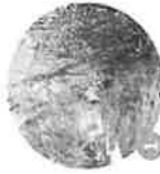
1 Arroyo Seco Confluence

Sections of the river and tributaries with no concrete bottom or levees.