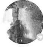
5 Arroyo Seco Confluence