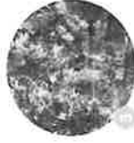
4 Bull Creek, Sepulveda Basin

Sections of the river and tributaries with a sediment bottom and concrete levees.