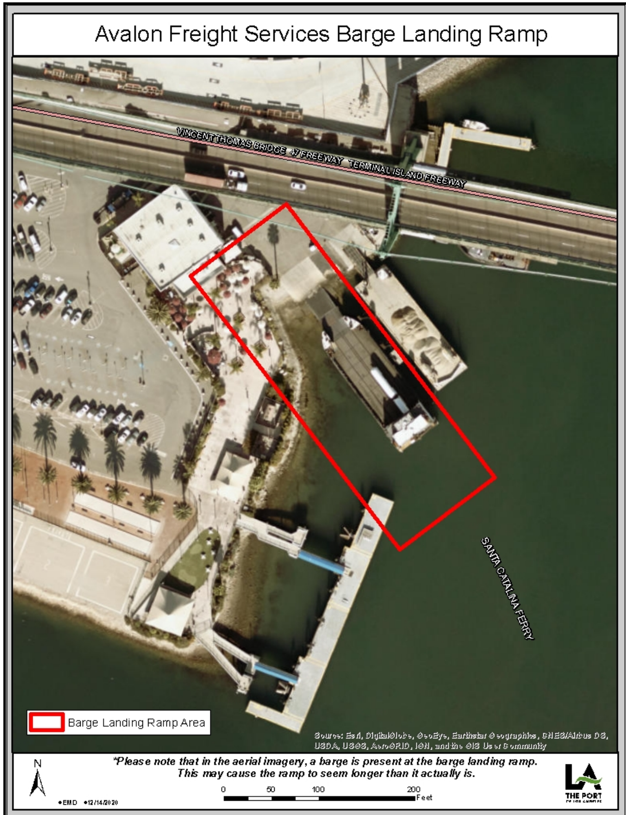
Figure 2 –Revised Proposed Project Area