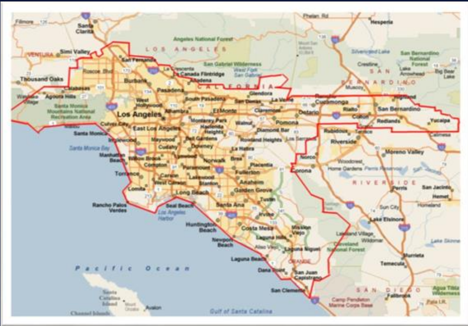
FTZ No. 202 Service Area