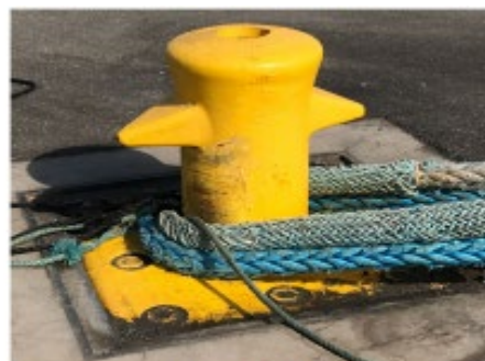
Single bitt bollard