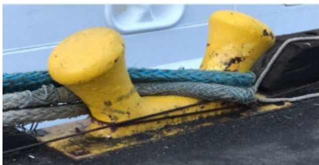
Double bitt bollard