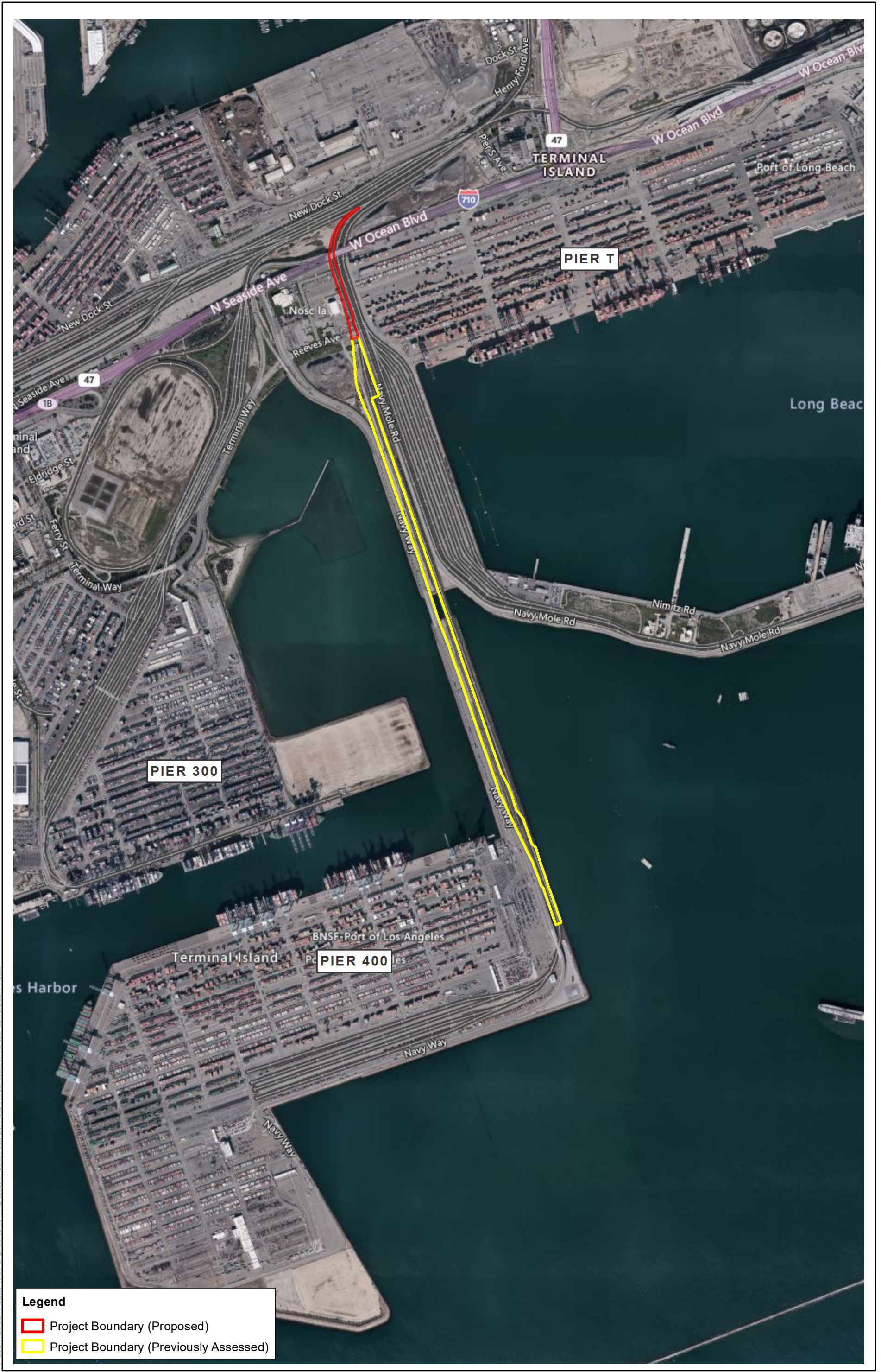
Figure 2 Previously Assessed and Proposed Additional Project Areas Terminal Island (Pier 400) Railyard Enhancement Project

W:\PROJECTS\GIS\1\Port_of_LA\00163_10_TIRE_support\Egures\Addendum\Fig02_ProjectFootprint.mxd, User: 25119, Date: 7/7/2020