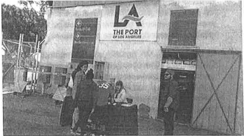
Banning High School Students checking in on a Saturday morning for a Navigation Lesson in Building G.

8. We were the subject of a POLA produced 3 minute video highlighting the importance of POLA-LAMI partnership to the community and the LA Waterfront (please navigate to: https://www.youtube.com/watch?v=VHgNOTqiotA )