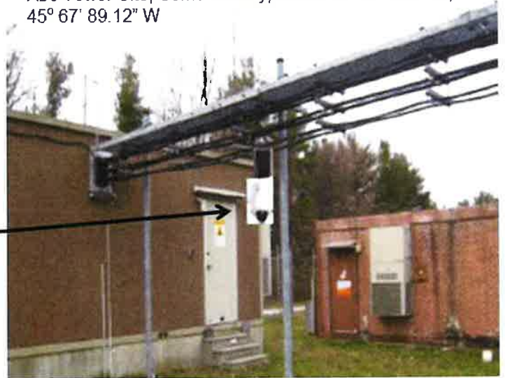
Figure 3. Ground-level photograph with graphic showing proposed equipment installation.

Ground-level photograph with excavation area close-up. The example in Figure 4 shows the proposed location for the concrete pad for a generator and the ground disturbance to connect the generator to the building's electrical service. This information can be illustrated with either an aerial or ground-level photograph, or both. This example has the name and physical address of the project site.