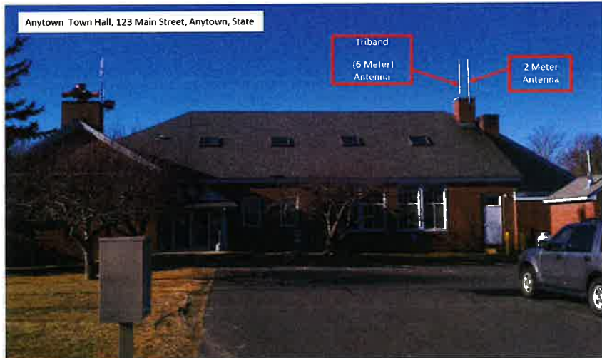
Figure 2. Example of ground-level photograph showing proposed attachment of new equipment.

Ground-level photographs. The ground-level photograph in Figure 2 supplements the aerial photograph in Figure 1, above. Combined, they provide a clear understanding of the scope of the project. This photograph has the name and address of the project site, and uses graphics to illustrate where equipment will be installed.