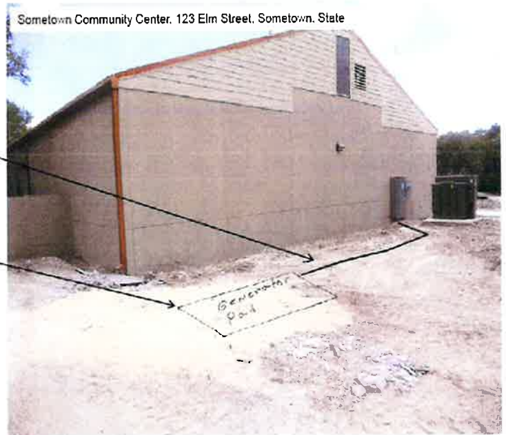
Figure 4. Ground-level photograph showing proposed ground disturbance area.