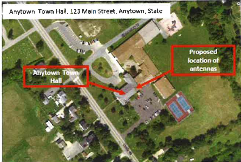
Figure 1. Example of labeled, color aerial photograph.

Aerial Photographs. The example in Figure 1 provides the name of the site, physical address and proposed location for installing new equipment. This example of a labeled aerial photograph provides good context of the surrounding area.