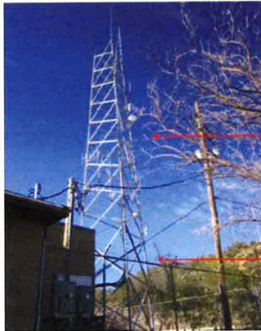
Any County Tower, State: 12.3456° N, 34.5678° W

Communications equipment photographs. The example in Figure 5 supports a project involving installation of equipment on a tower. Key elements are identifying where equipment would be installed on the tower, name of the site and its location. This example provides site coordinates in decimal format.