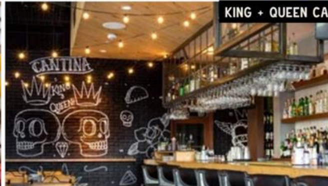
KING + QUEEN CANTINA