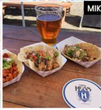
MIKE HESS BREWING