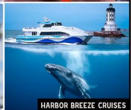
HARBOR BREEZE CRUISES