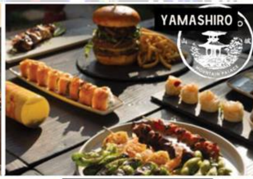
YAMASHIRO MOUNTAIN PALACE