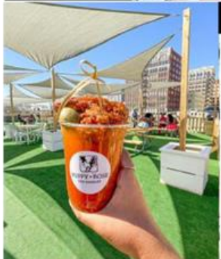
POPPY + ROSE