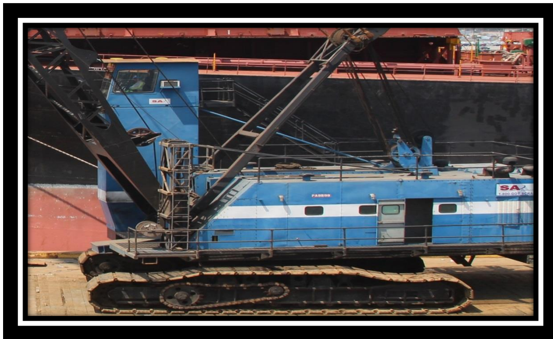
Figure 2-2 Existing Tier 2 Diesel American Crawler Crane