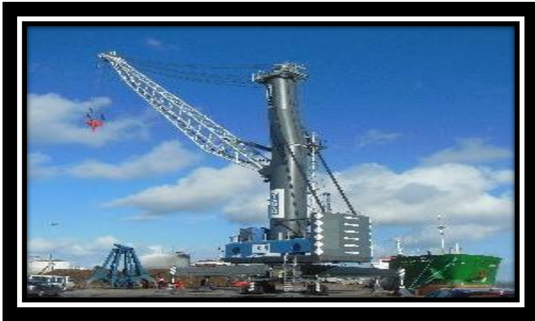
Figure 2-1 New Liebherr 550 Mobile Diesel/Electric Hybrid Crane