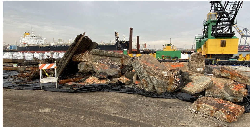
2/26/24 - Concrete & AC Debris Removal at Berth 178, Bents 19-23