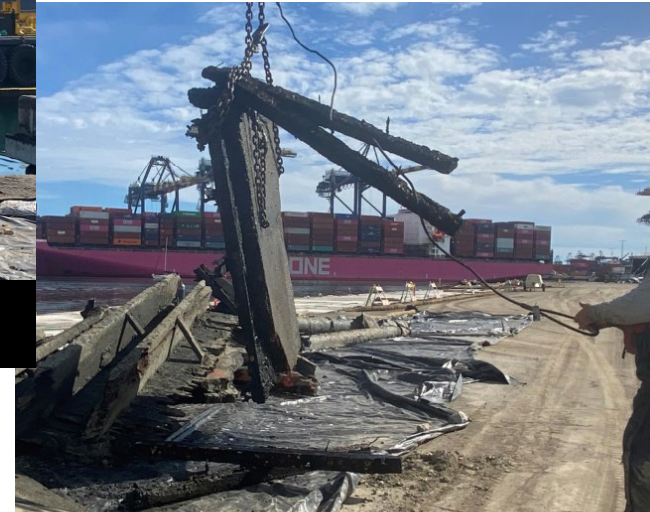
2/24/2024 – Timber and Asphalt Panel