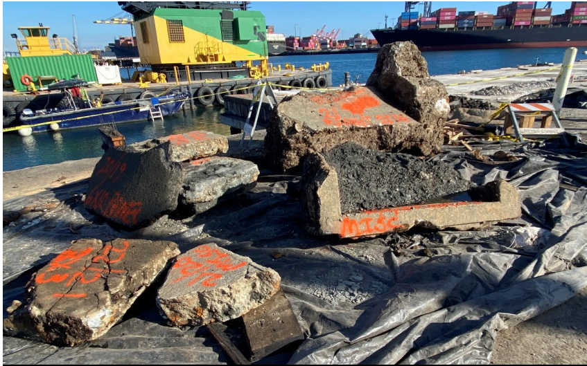
2/13/24 – Unforeseen Concrete and Asphalt Debris Removal at Berth 178, Bents 20-23. Sizes vary, up to 8'x3'x3'