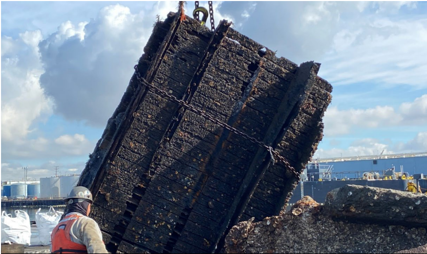
2/21/24 - Fallen Timber/Asphalt Deck Panel at Berth 178, Bents 17-18. Debris size is 12'x12'x9"