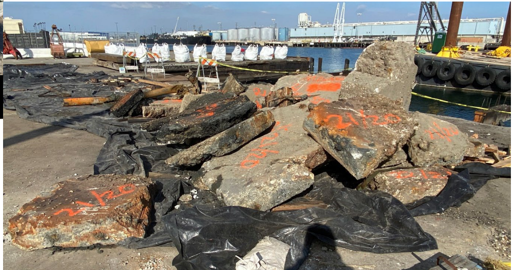
2/14/24 - Unforeseen Debris Removal at Berth 178, Bents 21-23. Misc. 6" pipe, Concrete and Asphalt sizes vary up to 3'x10'x8"