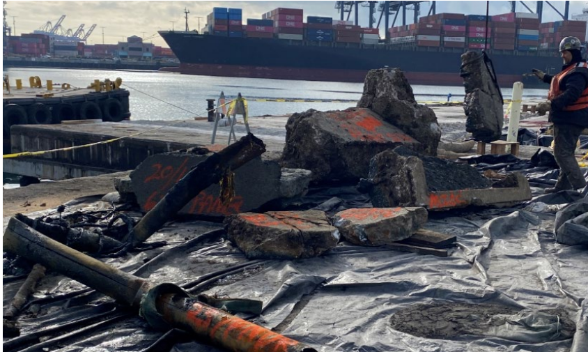
2/15/2024 – Concrete sections and utility lines