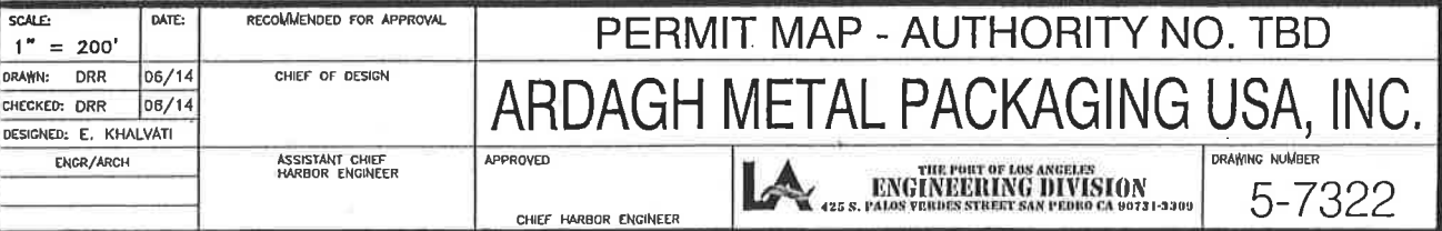
Exhibit A DRAFT

DWG: N:\cadd\project\O.W.L.E.A.S.E\Unassigned Drawings\57322 REV 1.dwg USER: rearschd DATE: Jan 29, 2015 9:32am XREFS: p-15 g-14 p-18 h-14 h-15 h-16 IMAGES: POLAPROG_VER.1_12/96