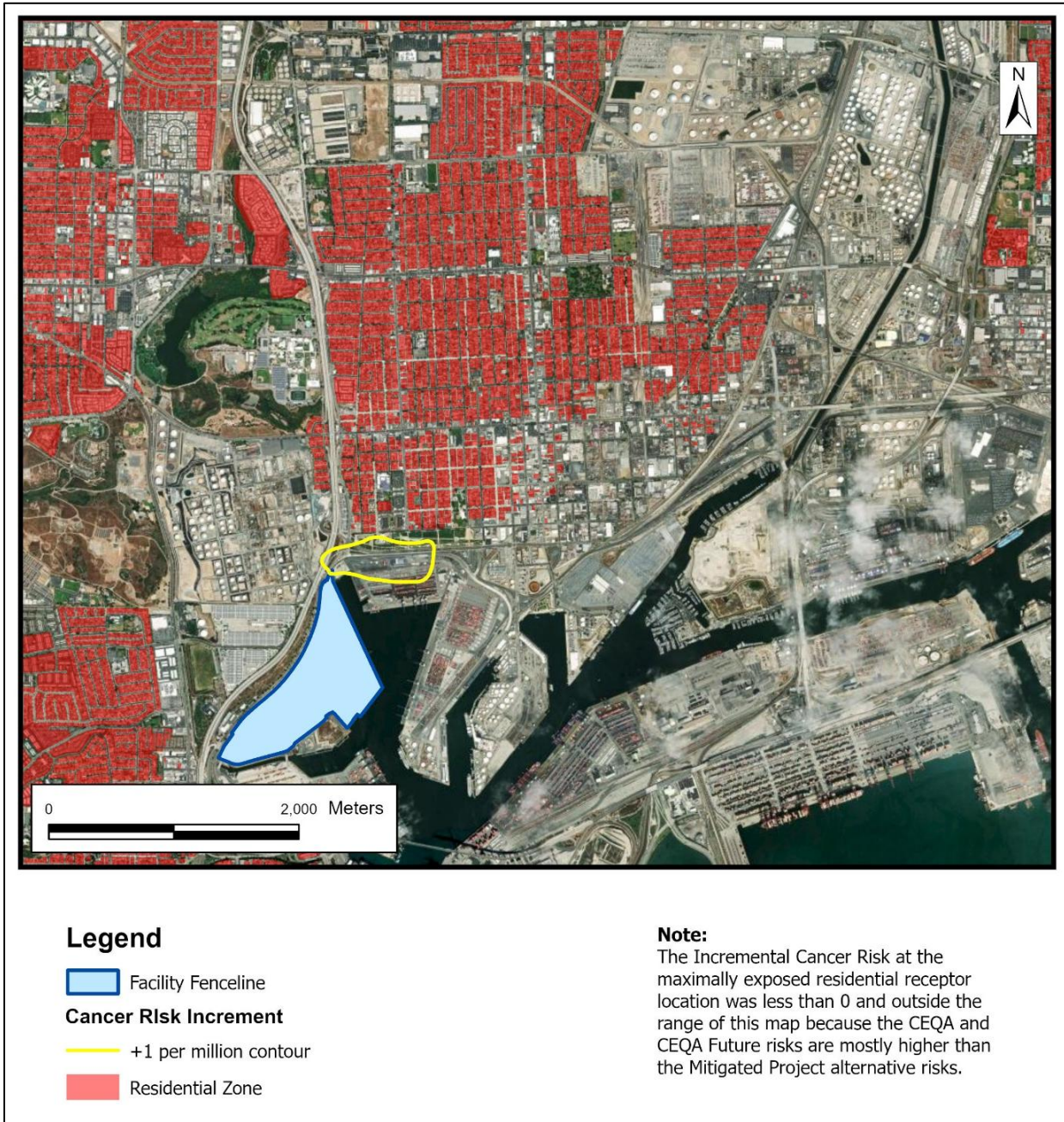
1 Figure 3.2-2: Isopleth of Residential 30-year Cancer Risk – Mitigated Proposed Project – 2 Future CEQA Increment