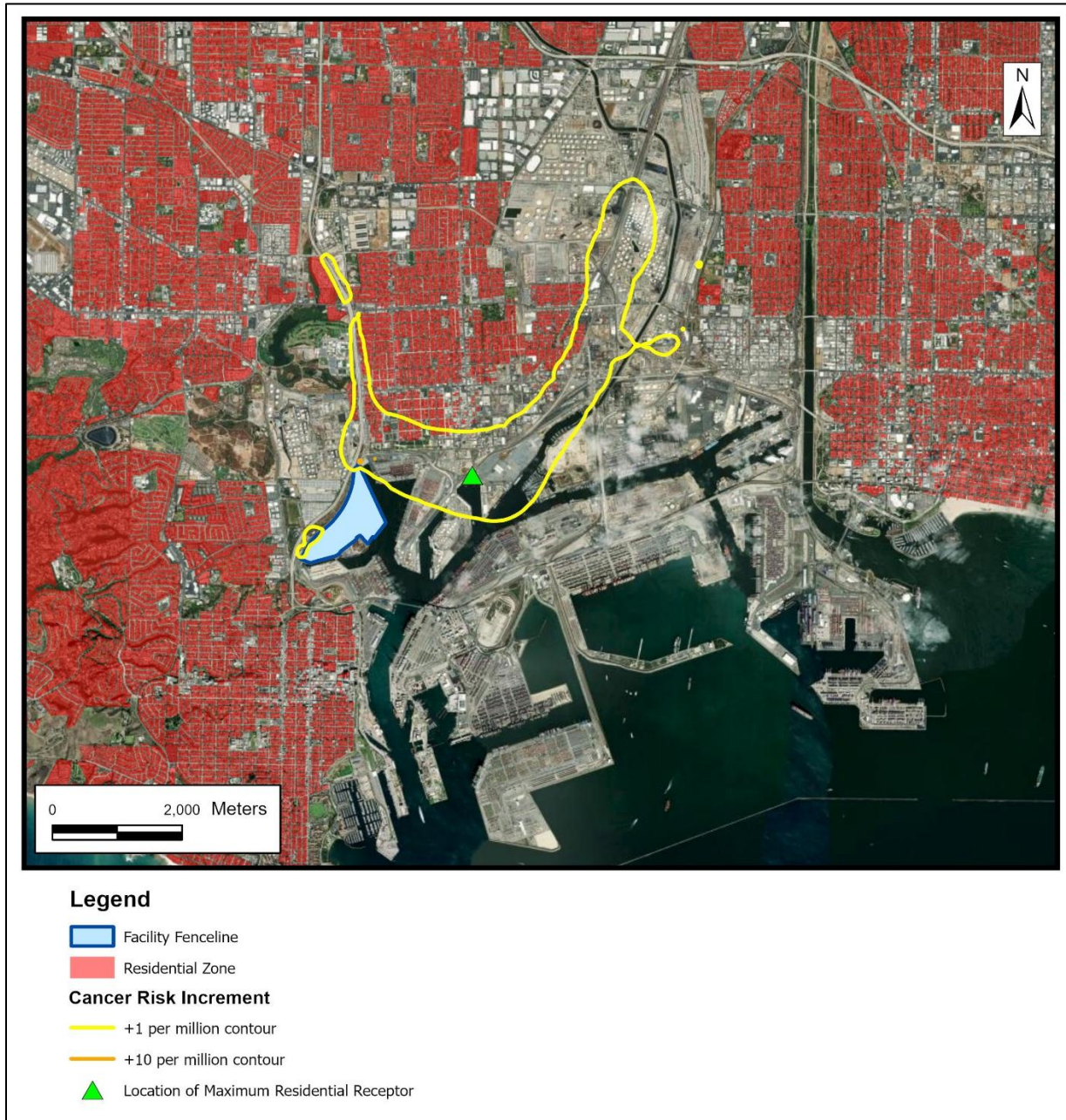
1 Figure 3.2-3: Isopleth of Residential 30-year Cancer Risk – Mitigated Proposed Project – 2 NEPA Baseline Increment