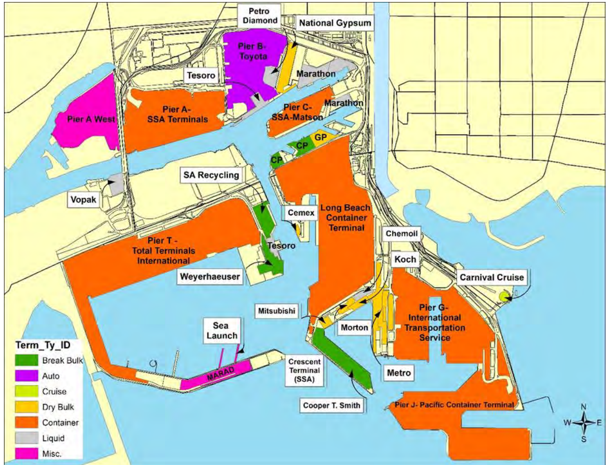
Figure 1.2: Port of Long Beach Terminals

Figures 1.2 and 1.3 show the land area of active Port terminals at the Port of Long Beach and the Port of Los Angeles, respectively. The geographical scope for cargo handling equipment is the terminals and facilities on which they operate. For the Port of Los Angeles EI report, the CHE emissions from the UP ICTF are included since UP ICTF is on port property. In the future, terminals may close or change their name, therefore the reader is cautioned to refer to the latest streamlined annual emissions reports for the latest terminal configuration and their names.