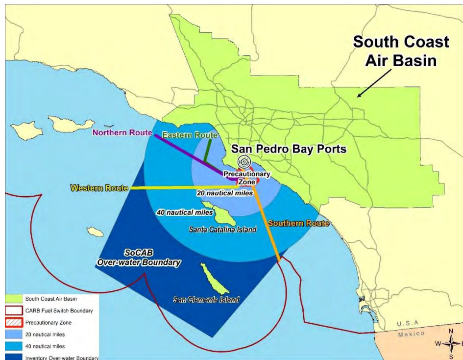
Figure 1.1: Emissions Inventory Geographical Extent

Figure 1.1 shows the over the water geographical extent of the SPBP emissions inventory, and other overlapping regulatory boundaries.