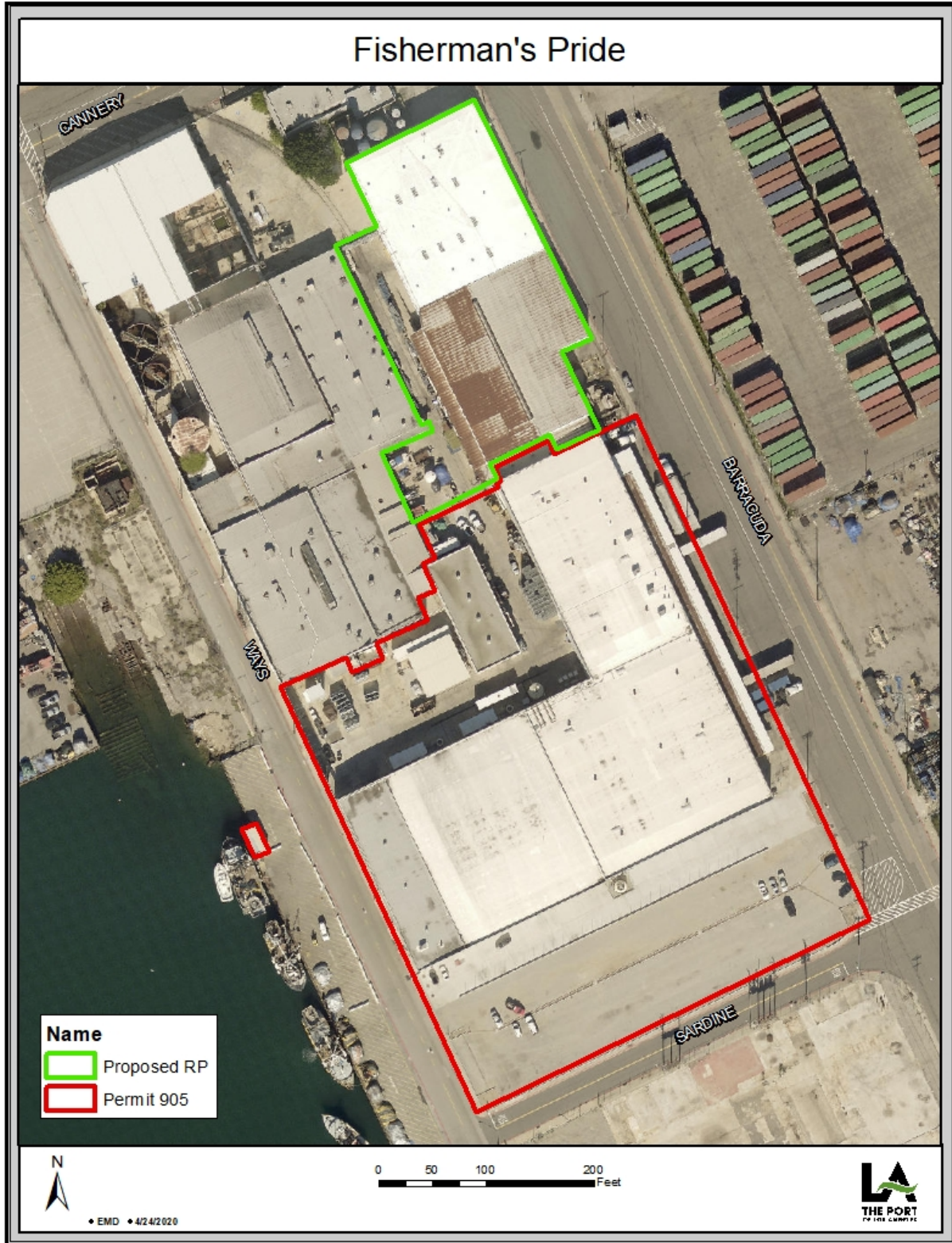
Figure 3 –Proposed Revised Project Footprint