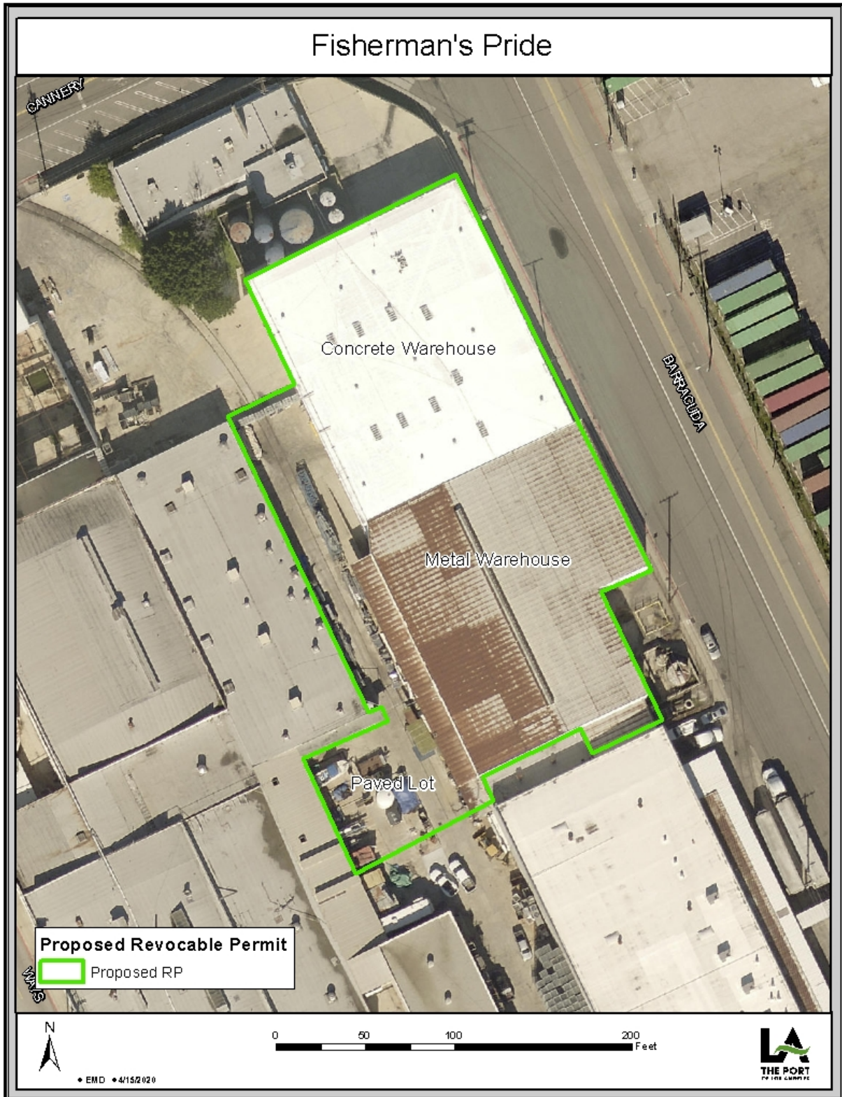
Figure 2 –Proposed Revocable Permit Area