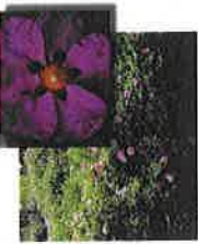
Cistus x. purpureus Purple Rockrose