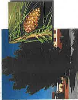
Pinus halepensis Aleppo Pine