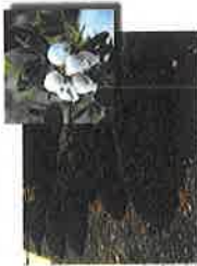
Arcrostaphylos Emerald Carpet Manzanita