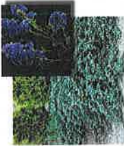
Ceanothus griseus horizontalis Carmel Creeper