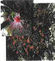
Calliandra eriophylla Fairy Duster