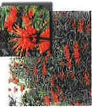
Leonotis leonurus Lion's Tail