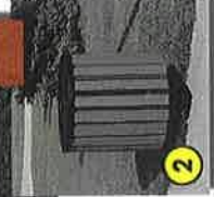
2 WASTE RECEPTACLE