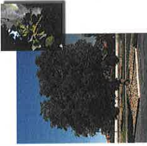
Quercus agrifolia Coast Live Oak