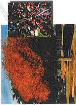
Pistachia chinensis Chinese Pistache