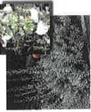
Salvia apiana White Sage