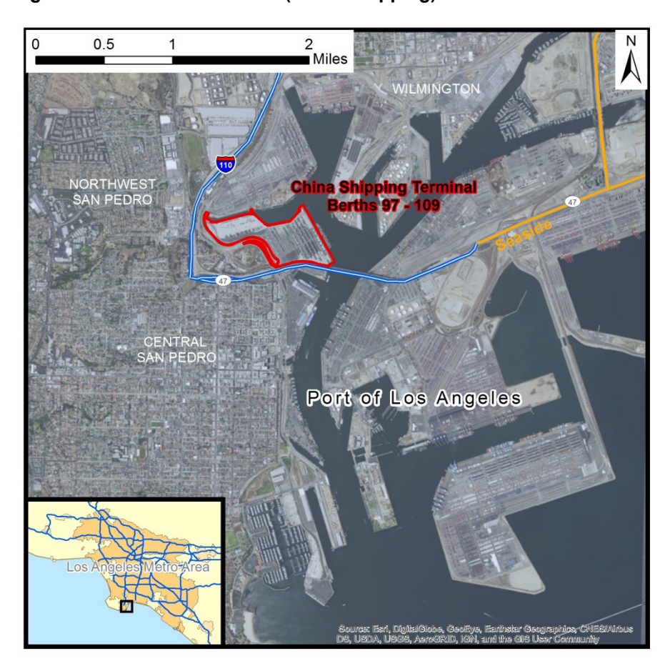
Figure 1-1: The Berths 97-109 (China Shipping) Container Terminal

In March 2001, based on the WBTIP EIR, the Port issued a permit to construct a threephased container terminal and entered into a lease for China Shipping to occupy the terminal. The lease (Permit No. 999) granted China Shipping nonexclusive use of 72.48 acres at Berths 100-102 for operation of a container terminal facility for a term of twentyfive years with three five-year options to extend, exercisable by China Shipping. LAHD would develop and construct the terminal, designed to optimize operations at Berths 97-109, for its tenant, China Shipping. As part of the lease, West Basin Container Terminal LLC (WBCT), a subsidiary of China Shipping, operates the terminal backlands. The lease requires that the premises be used for activities, operations, and purposes incidental to and related to the operation of a container terminal, and prohibits any other use of the premises without prior approval of the Port. In October 2001, the Port granted a coastal development permit to begin construction of Phase I of the CS Terminal Project.