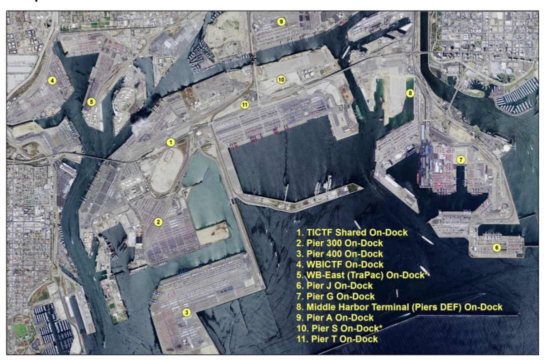
Figure 1-3: Existing and Proposed On-Dock Railyards in the San Pedro Bay Port Complex

Based on this updated analysis of cargo demand and capacity, LAHD has estimated that, as presently configured, the Berths 97-109 Container Terminal's maximum capacity is 1,698,504 TEUs per year. Under current assumptions of cargo growth, that capacity will be reached by 2030. The 2008 EIS/EIR estimated the terminal's maximum capacity at 1,551,000 TEUs per year, meaning that the new estimate is approximately ten percent greater than the original estimate.