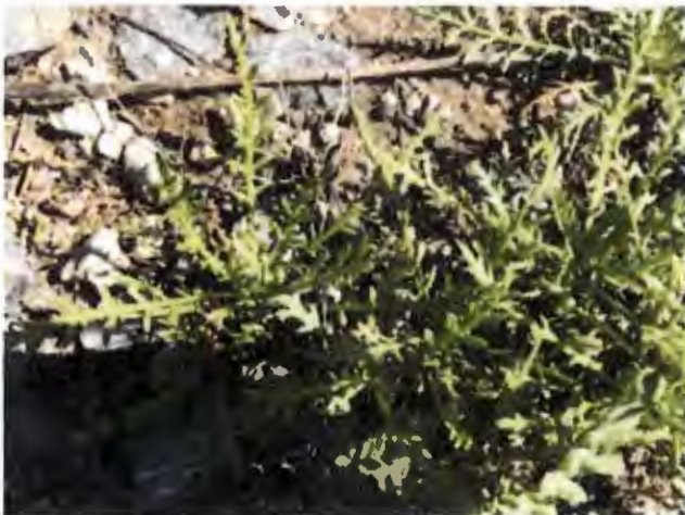
Photo 4 – Stem has very small micro thorns that are soft when plant is green and flexible.