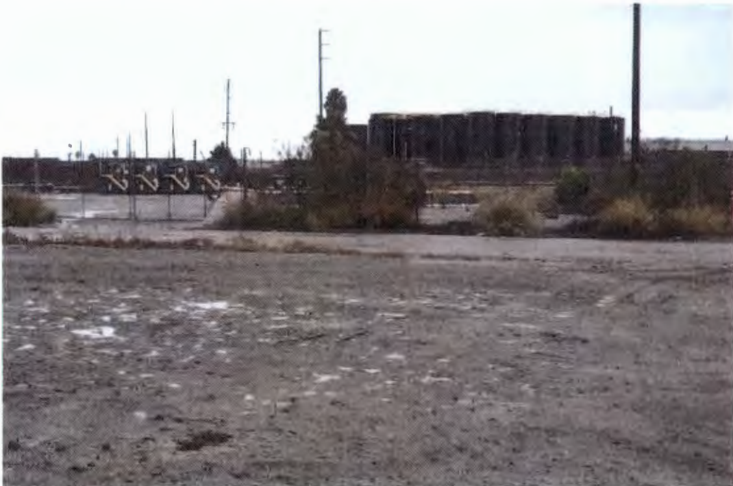
Photo 2 – Turnaround area with evidence of recent disturbance. The strip between the turnaround area and the road supports the tarplant