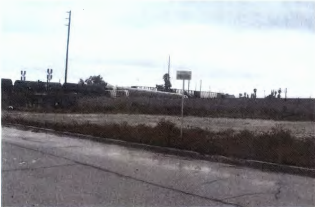
Photo 1 – Resource sign on western edge of the property along Southerland Ave.