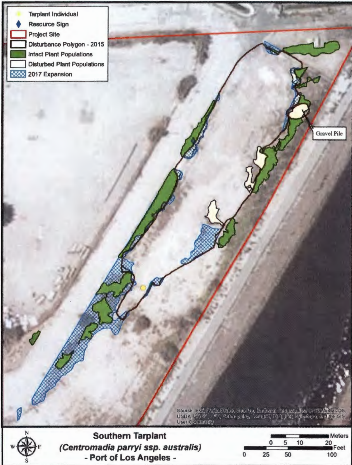
Figure 1 – Southern Tarplant Recovery and Expansion from 2016 Impacts