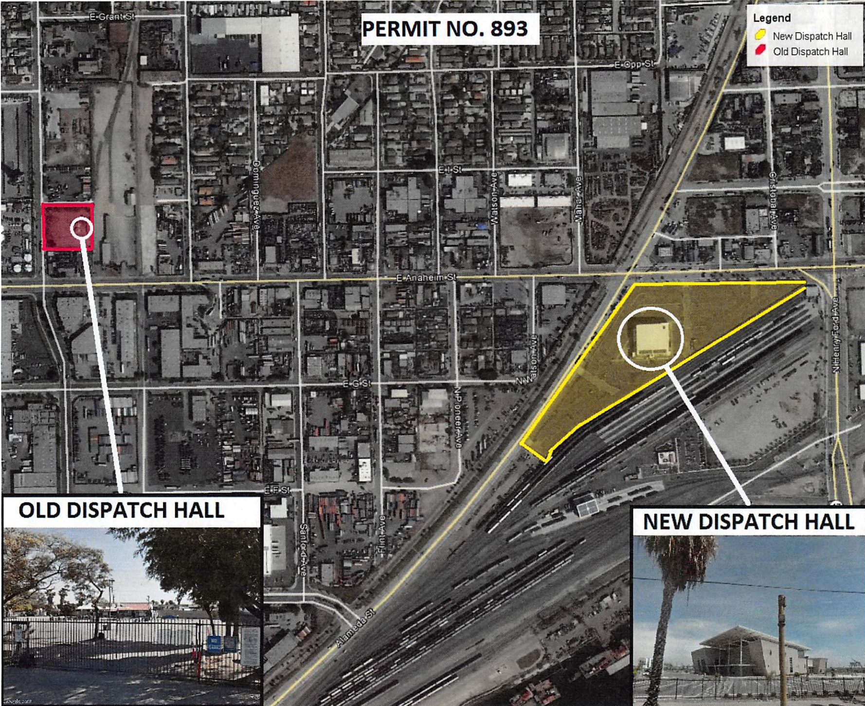
OLD DISPATCH HALL