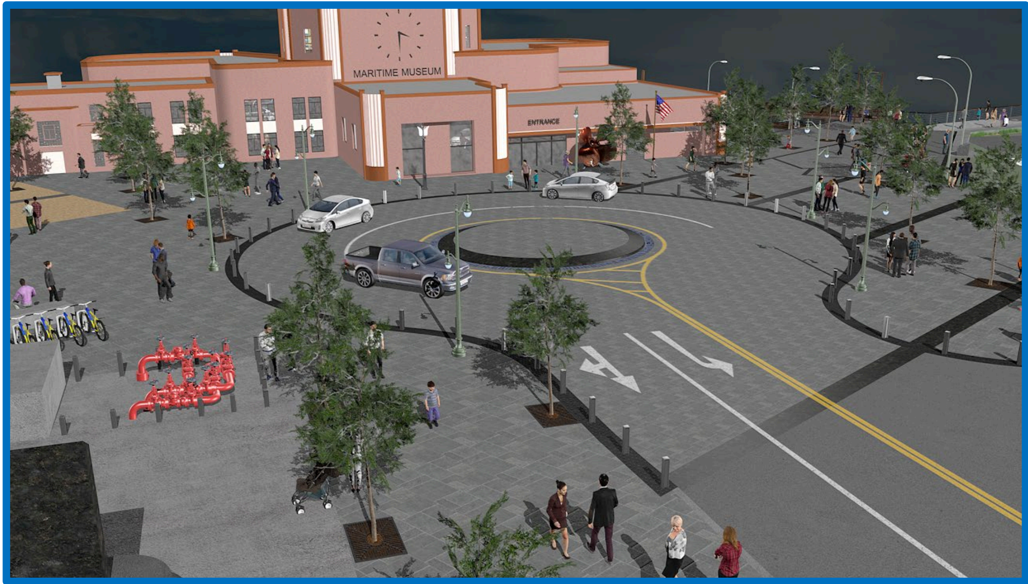
TOWN SQUARE RENDERING SAN PEDRO WATERFRONT – BERTHS 74-84 PROMENADE AND TOWN SQUARE SPECIFICATION NO. 2807