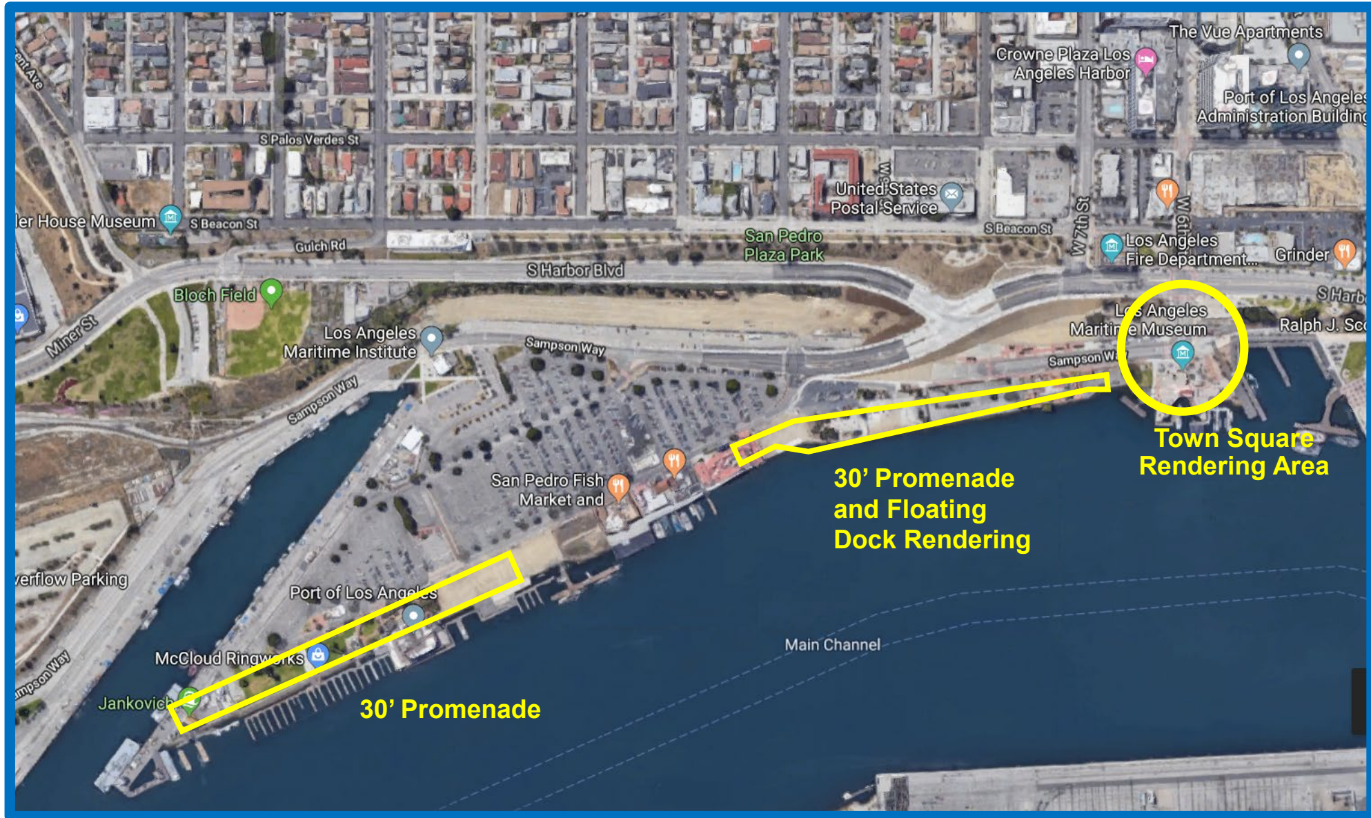
LOCATION MAP SAN PEDRO WATERFRONT – BERTHS 74-84 PROMENADE AND TOWN SQUARE SPECIFICATION NO. 2807