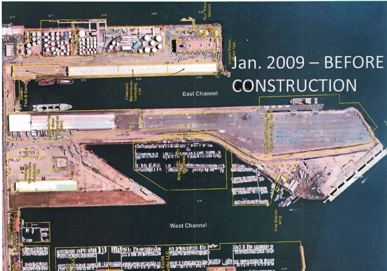
Jan. 2009 – BEFORE CONSTRUCTION