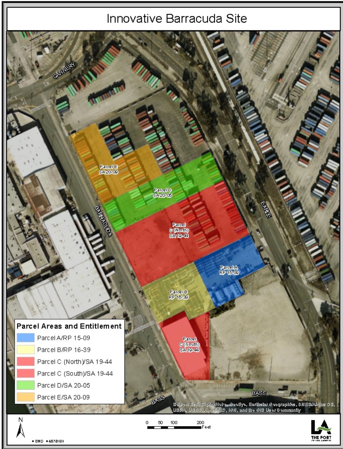
Figure 2. Existing Parcels