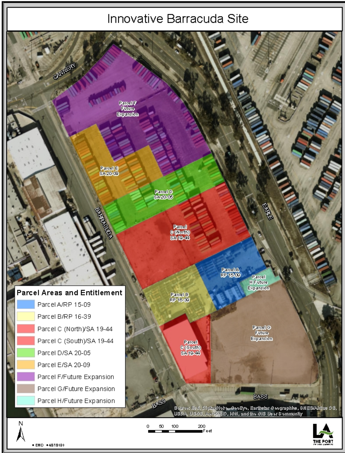
Figure 3. Proposed Term Permit Boundaries