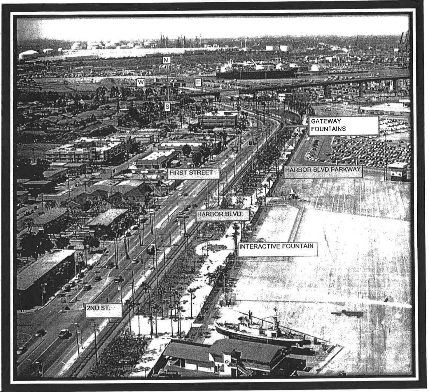
INTERACTIVE AND GATEWAY FOUNTAINS – VIEW TO NORTH