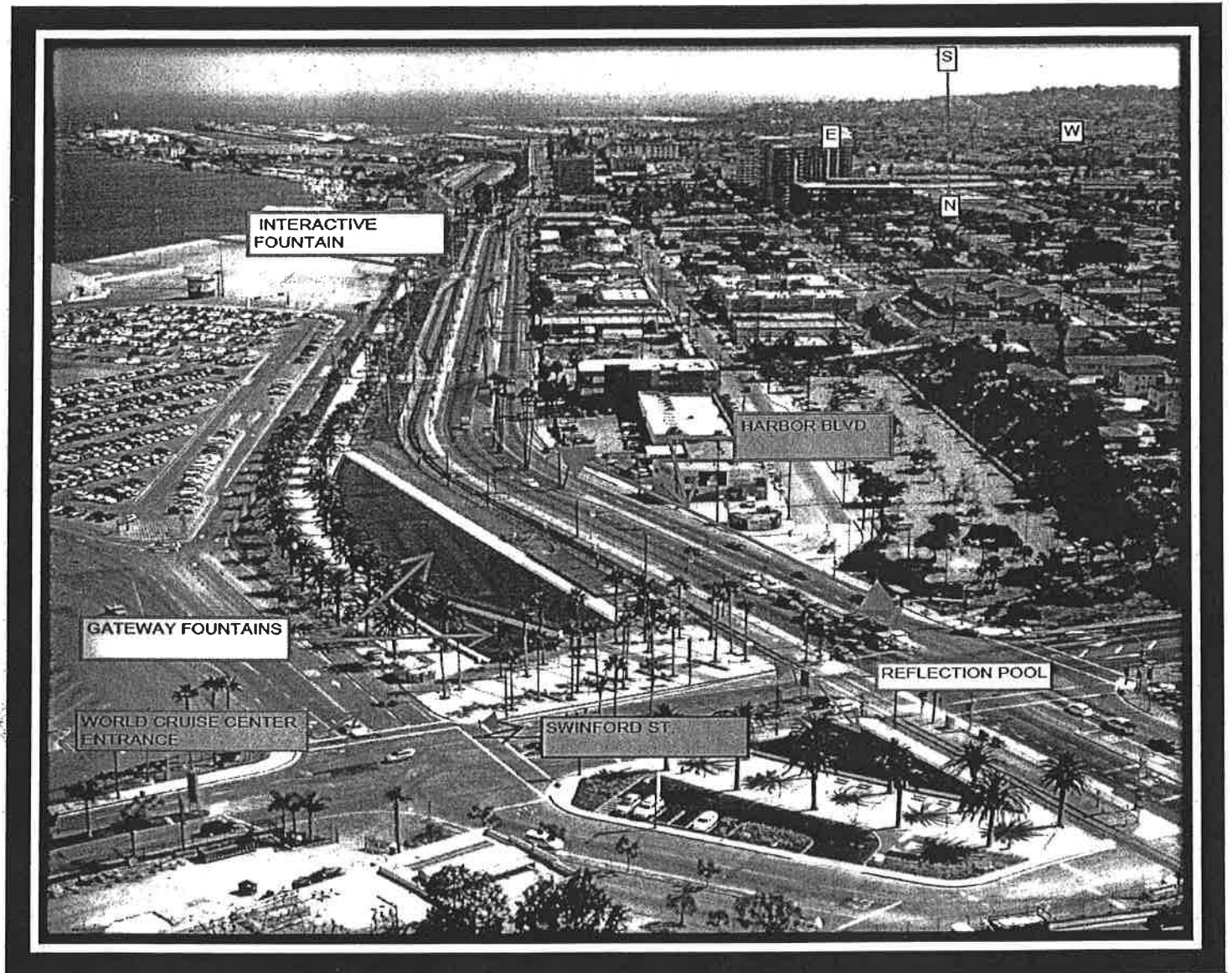
GATEWAY AND INTERACTIVE FOUNTAINS – VIEW TO SOUTH