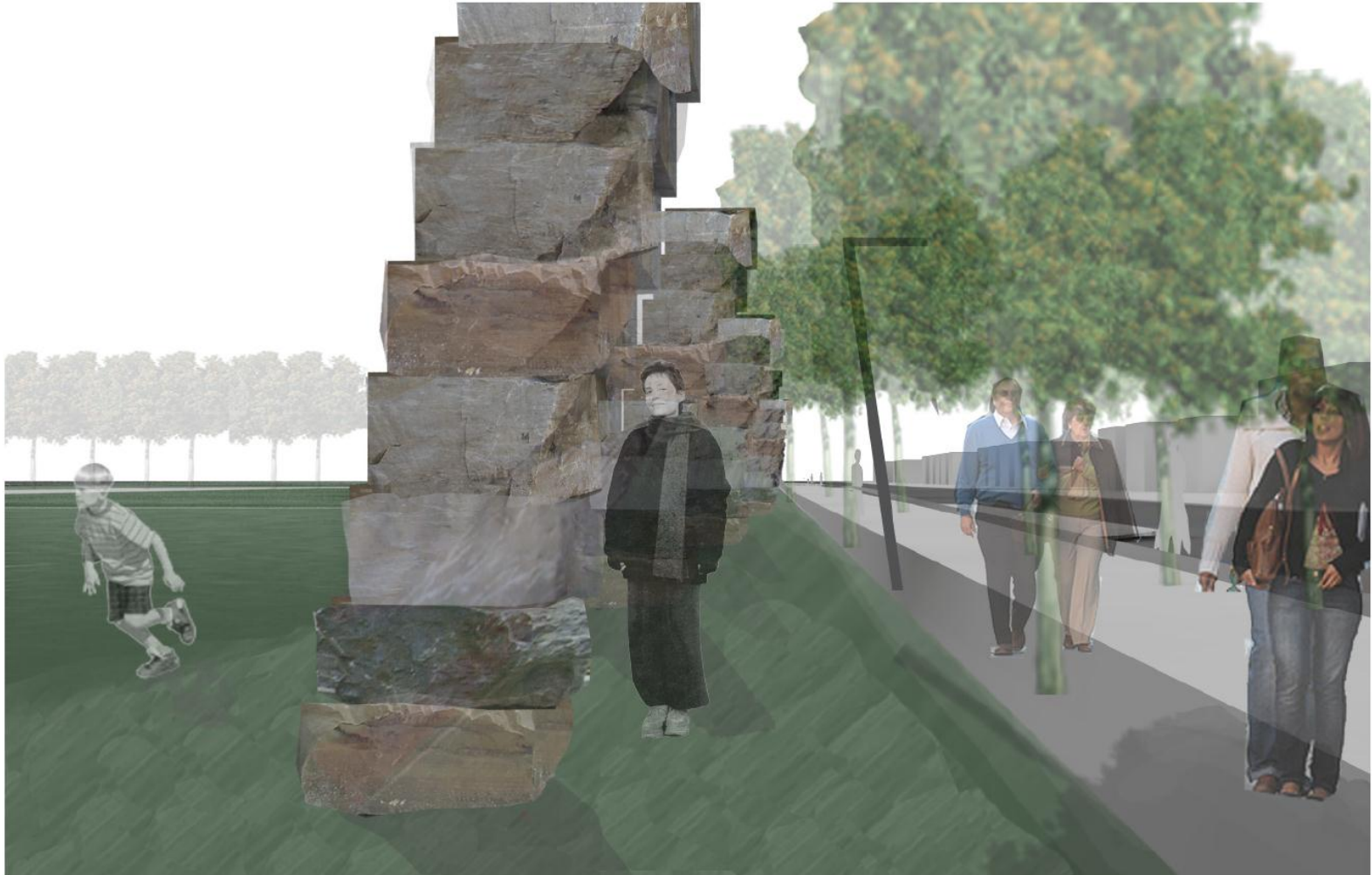
View from center of installation – sandstone columns reach maximum height (14') and spacing (240')