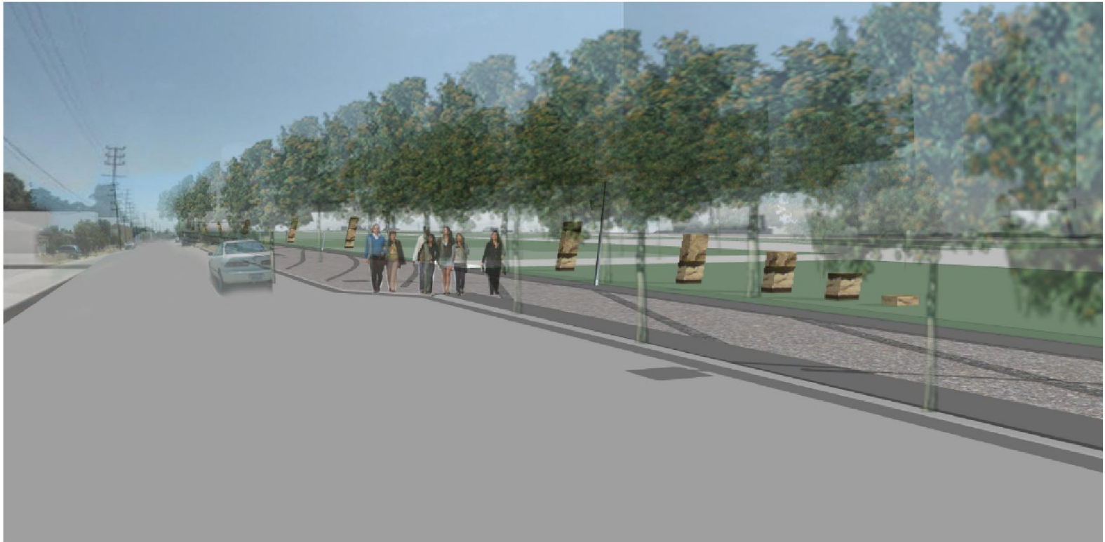
View looking east along West C Street – sandstone columns begin with low height (0') and close spacing (1')