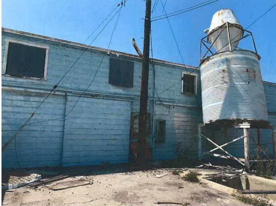
Exterior – North Side, Lumber Shed