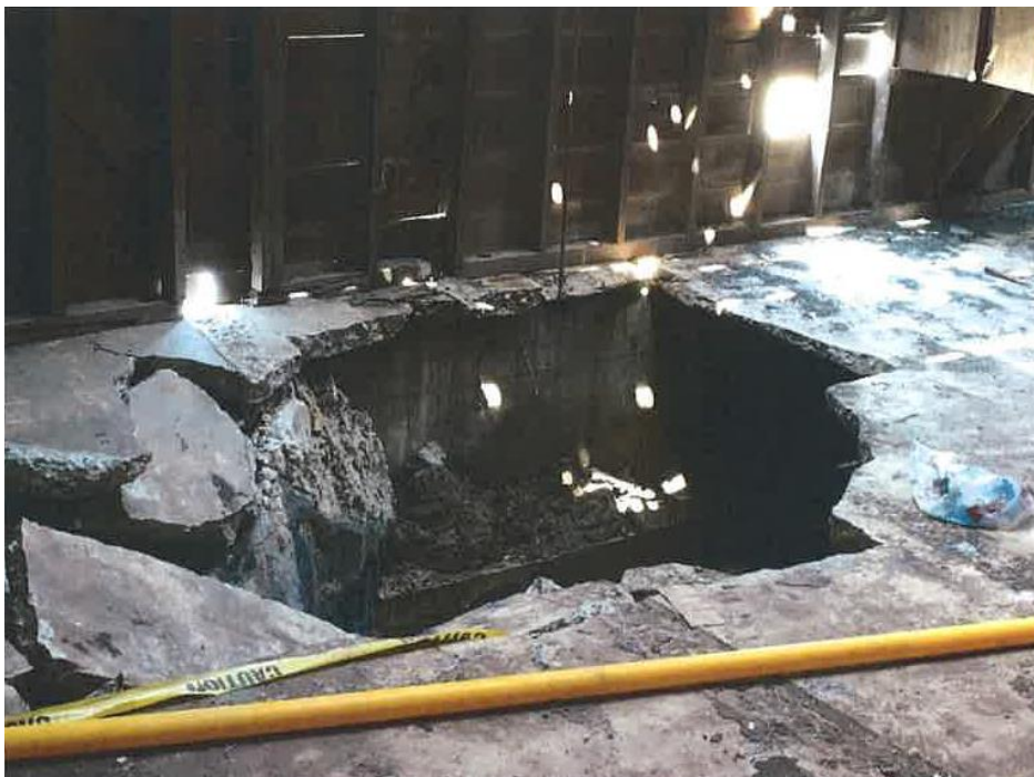
Interior – Sink Hole, Seawall Visible