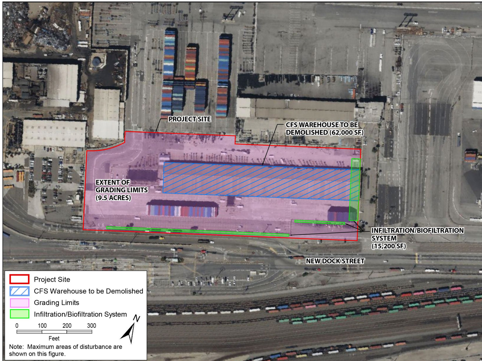
Figure 2.1-3. Conceptual Site Plan