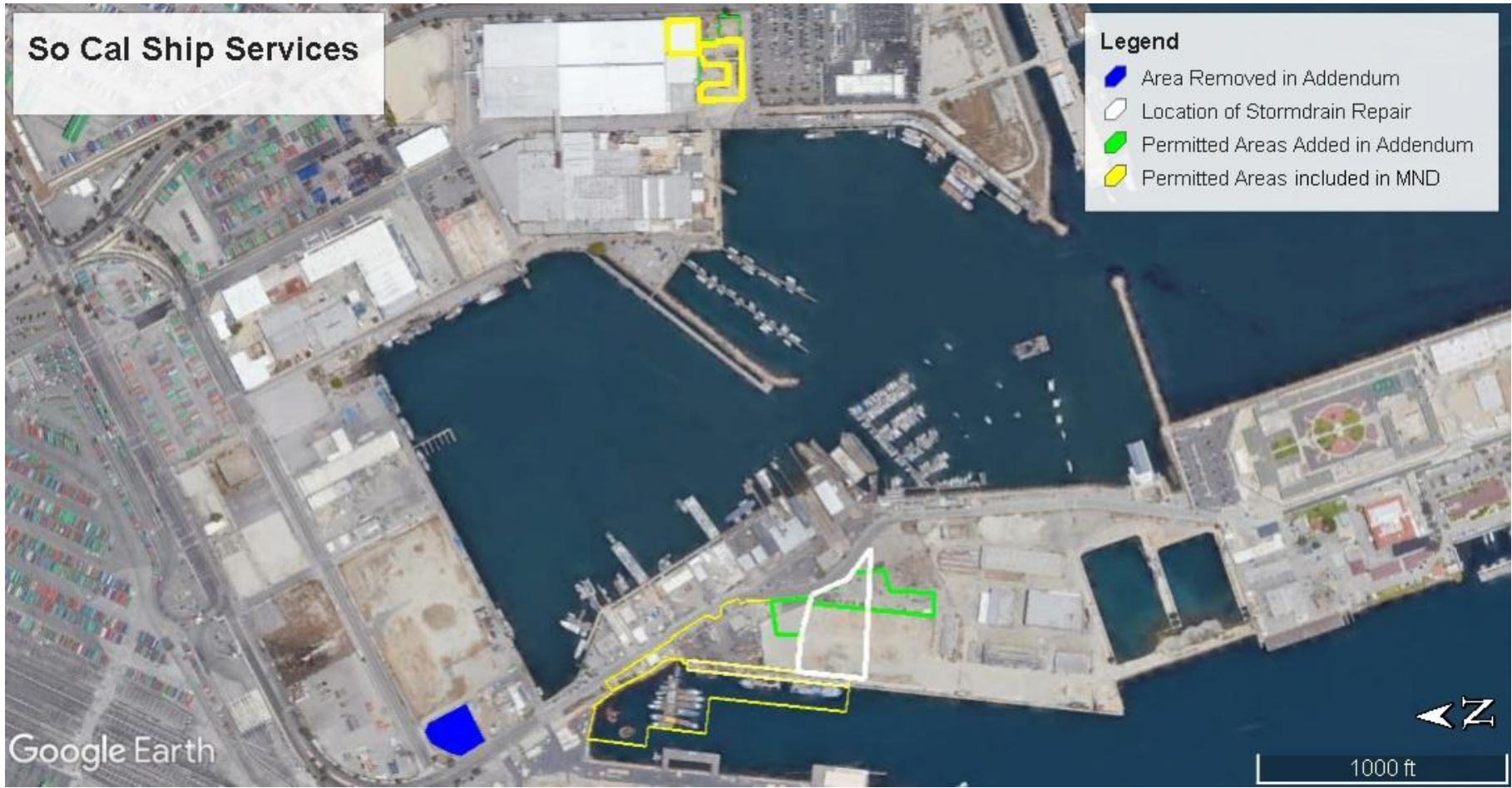
Figure 2 – Revised Proposed Project from the First Addendum