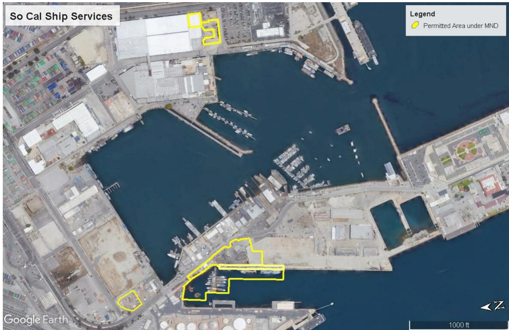
Figure 1 – Approved Project from Final IS/MND