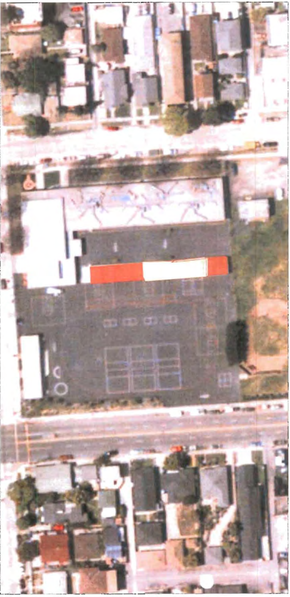
Saints Peter and Paul School - 706 Bay View Ave. in Wilmington